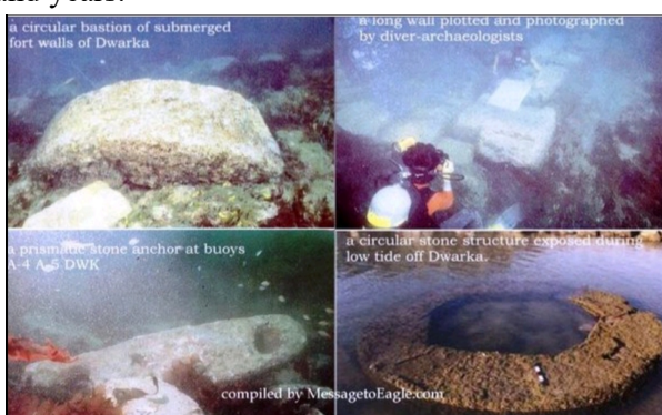
Fig.2- Various submerged structures of Dwarka

IV) Holocene sea-level rise, regional subsidence, and coastal erosion are well documented along the Saurashtra coast. Tectonics, sedimentation, and episodes of storm surge/marine transgression can explain partial submergence of low-lying settlements in the last several thousand years.